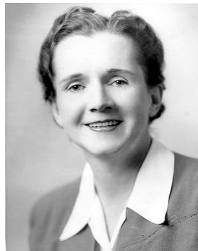
Rachel Carson, author of Silent Spring

False. In 2010, the President's Cancer Panel, a congressionally mandated panel of experts working under the auspices of the U.S. Department of Health and Human Services, the National Institutes of Health and the National Cancer Institute, released a landmark report, " Reducing Environmental Cancer Risk, What We Can Do Now. " A letter by the authors to President Obama concluded that the U.S. government has "grossly